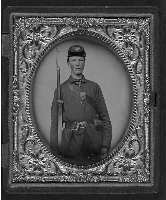
Unidentified soldier in Union uniform and plumed infantry Company A Hardee hat with bayoneted musket, cap box, and cartridge box in front of painted backdrop showing landscape (LC).